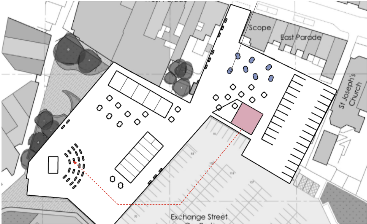
2.4 Option 4: Permanent Mixed-Use Development