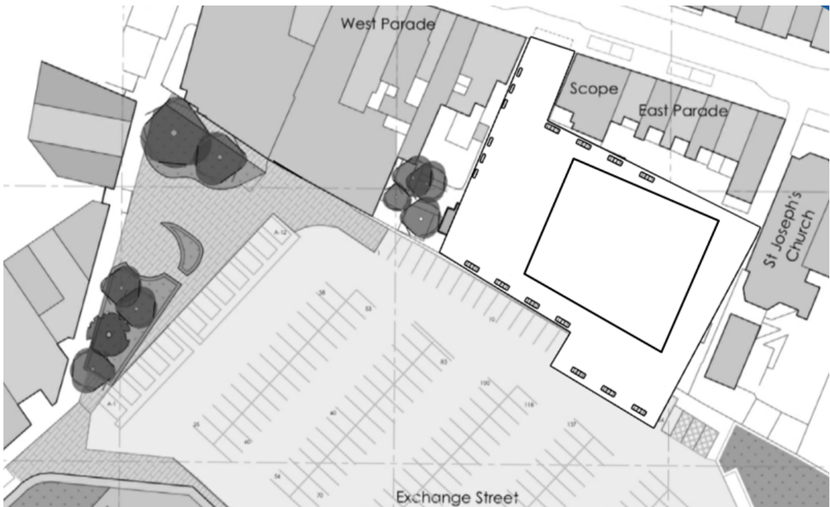
2.5 Option 5: Meanwhile Uses Plus Permanent Mixed-Use Development